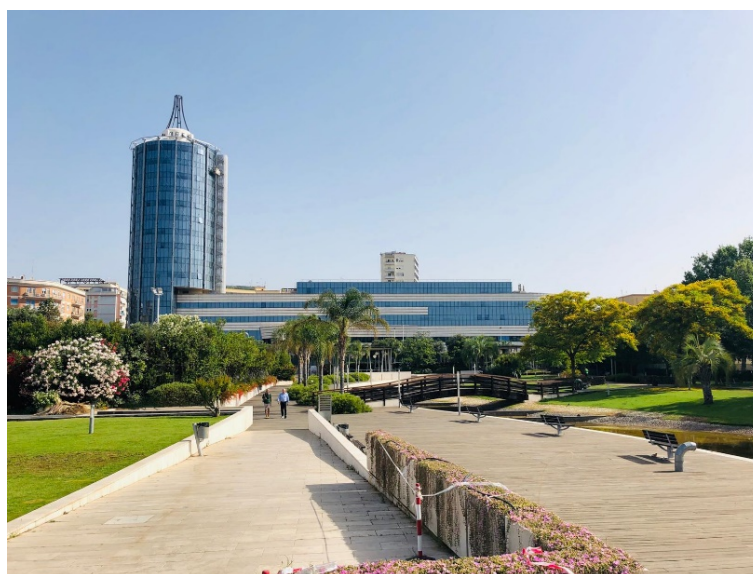
Image of the venue, T Hotel.